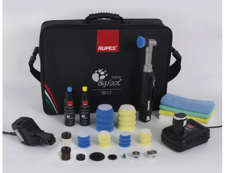
NANO LONG NECK KIT Cod HR81ML/DLX