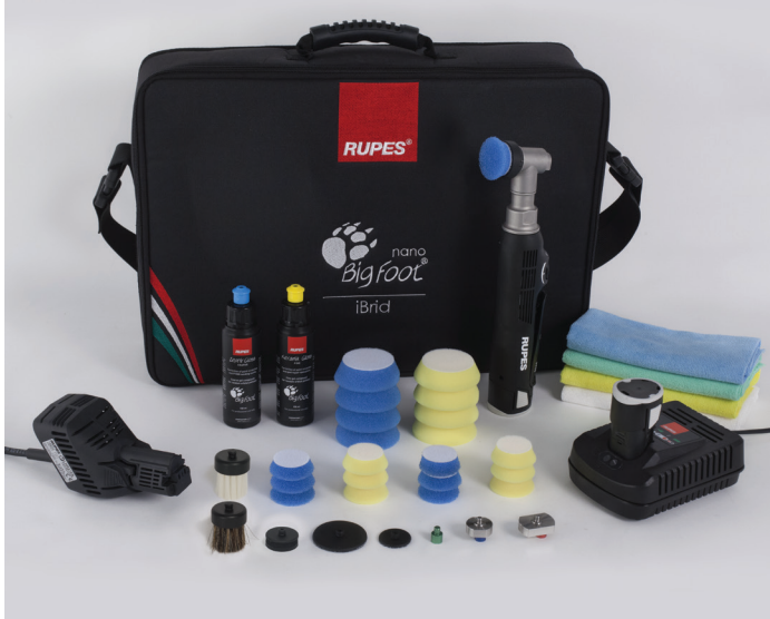
NANO SHORT NECK KIT Code HR81M/DLX